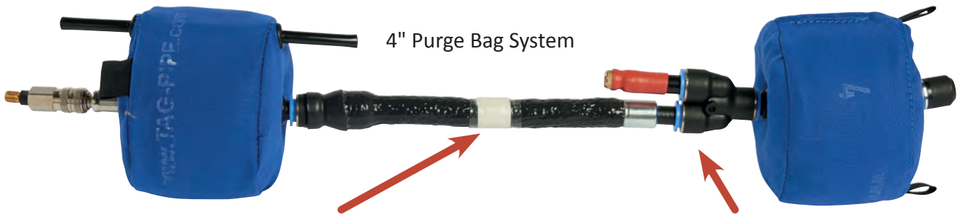
4" Purge Bag System

Used for 90% of the traditional pipe weld purging applications to provide bright, shiny, oxide free weld roots. The TAG Pipe Purge System are quick and easy to use providing a very rapid weld purge. High quality materials are used in the manufacture of these systems guaranteeing perfect oxide-free weld roots in very little time.