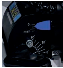
Continuous angle adjustment from 0 to 60 degrees.