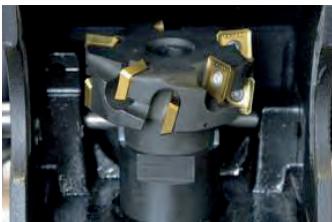
Mono block milling head, with 10 indexable inserts fixed with screws.