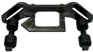
Pipe bevelling possible with no accessories up to 12". An optional attachment for bevelling up to 24" pipe is also available