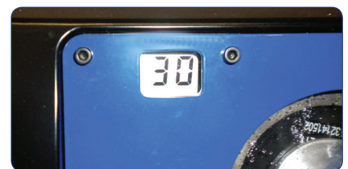
Digital angle readout