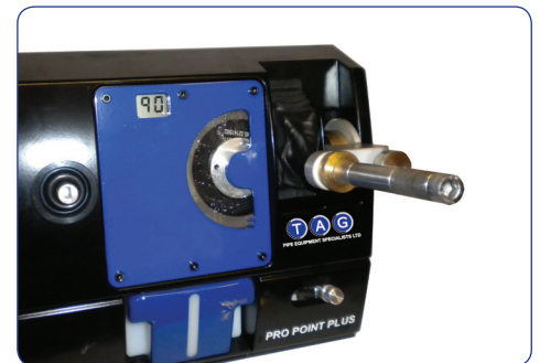
Holder can easily positioned to flatten tip at 90°