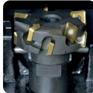
Mono block milling head, with 10 indexable inserts fixed with screws.

Pipe beveling possible with no accessories up to 12". An optional attachment for beveling up to 24" is also available.