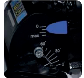
Continuous angle adjustment from 0 to 60 degrees.