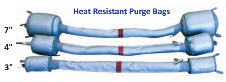
e.g. 7" Pipe will purge in less than 4 minutes!

These versions of our inflatable pipe purging systems are heat resistant up to 350°C (572°F) for up to 24 hours, or up to 500°C for short periods of time, as with the standard systems, the heat