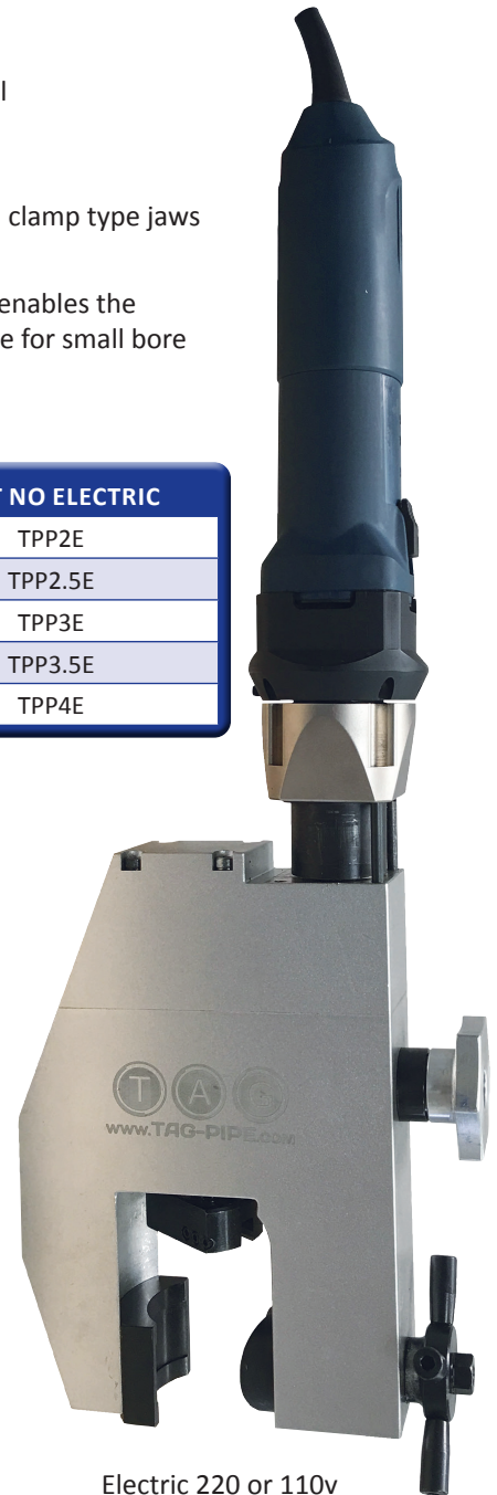
Electric 220 or 110v